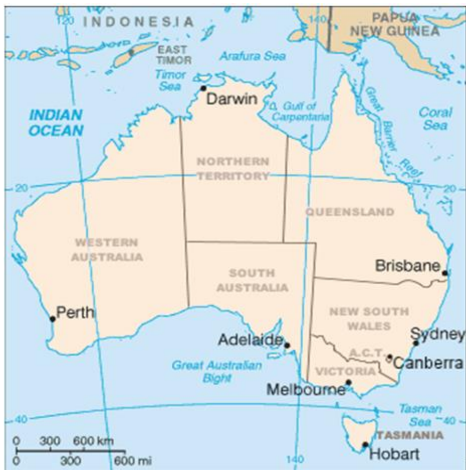
Figure 3: Australian States and Land Search Areas