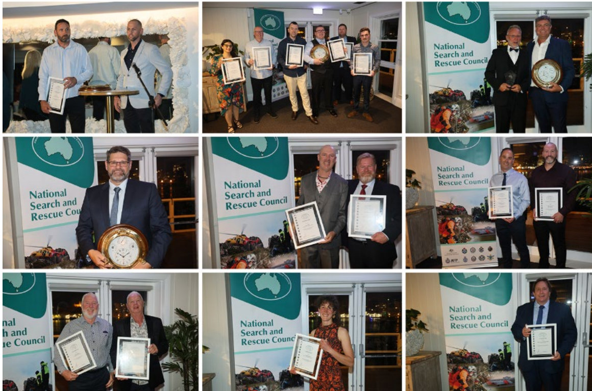
Figure 5: The 2024 Australian SAR Award recipients receiving their awards at the awards event at the Manly Pavillion, Manly, NSW.

Read the media release and incident summaries on the NATSAR Council website.