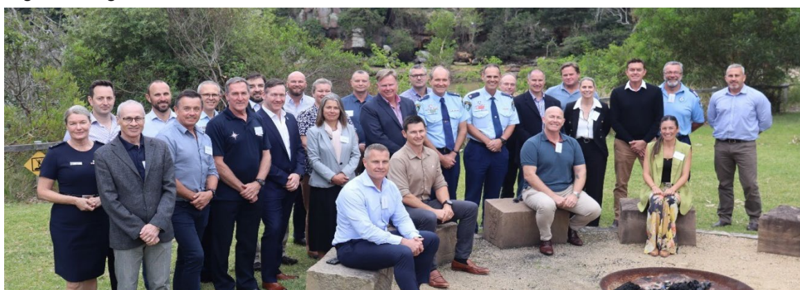
Figure 4: The National Search and Rescue Council at their 48th annual meeting at the Australian Institute of Police Management (AIPM) in Manly, NSW.

Each year the Council recognises outstanding contributions to search and rescue through the Australian SAR Awards Program. The national awards event was held at the Manly Pavilion in Sydney where recipients were presented their national awards on behalf of the Council from four award categories; professional SAR, professional volunteer, non-professional SAR and long-standing contributions to SAR.