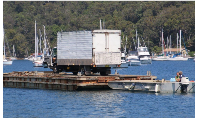
Figure 7: unpowered barge attended by an inappropriate vessel

State, territory and commonwealth work health and safety laws.