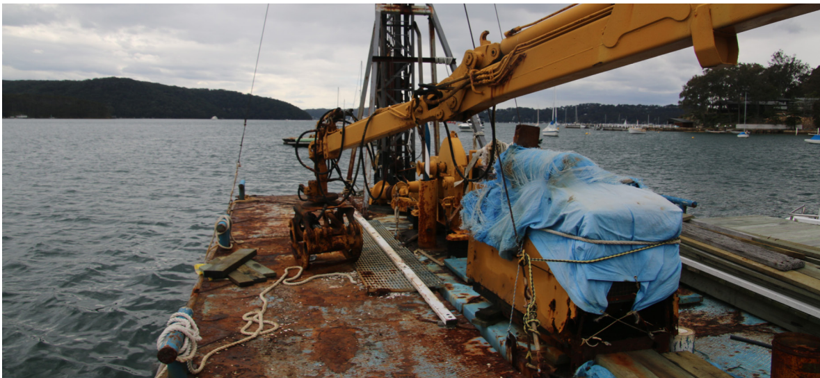
Figure 1: unpowered barge with corroded deck