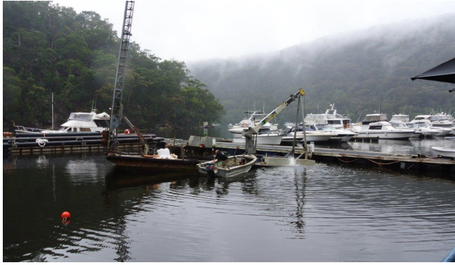
Figure 4: unpowered barge with excessive trim

The operations undertaken on board the barge are to be addressed in the vessel's SMS and must include a risk assessment to mitigate and manage risk to the vessel, its personnel and the environment.