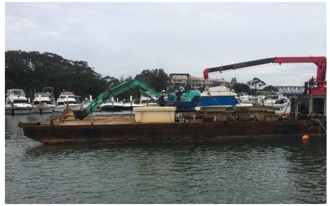
Figure 6: unpowered barge with both fitted and loaded lifting appliances