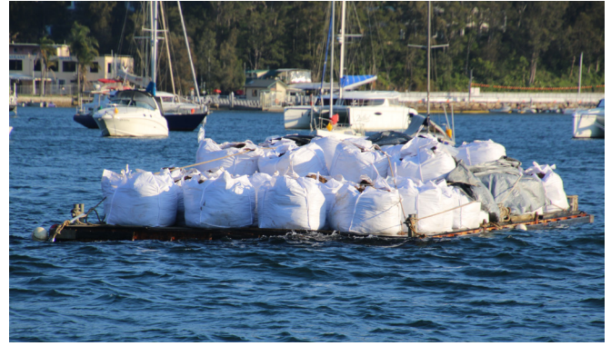
Figure 3: unpowered barge with insufficient freeboard