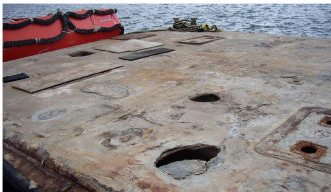
Figure 5: unpowered barge with holed deck