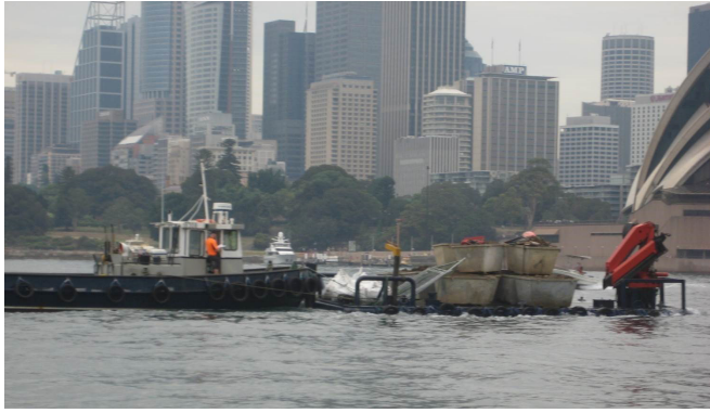
Figure 2: unpowered barge with unsecured cargo